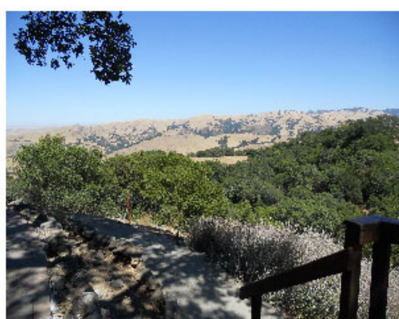
Blackberry Springs Ranch, Fremont