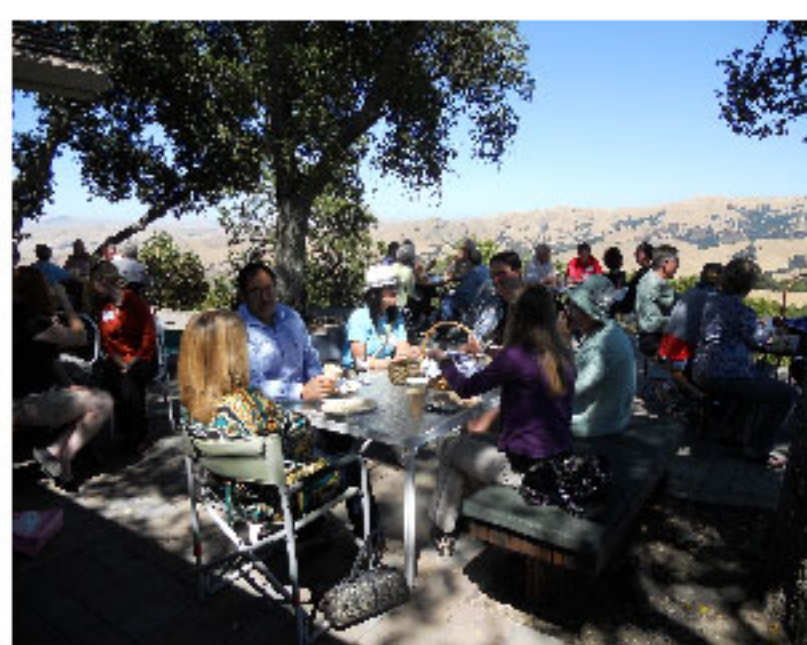
Guests enjoying a beautiful day.